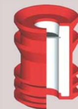
REG Bottom Plug

The non-rotating plugs are designed to minimize drilling time.