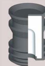
REG Top Plug