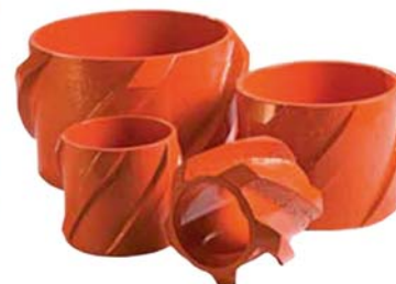
Solid Body Spiral Blades