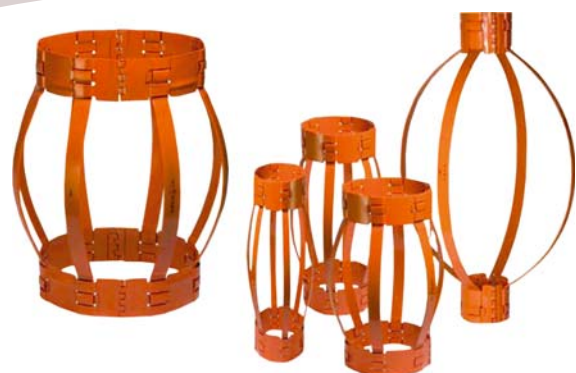
Bow Spring Casing